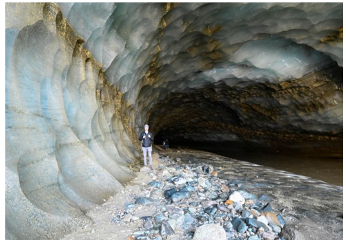
8/28/21 Inside the Castner Glacier Ice Cave (for just a few minutes we promise!!)