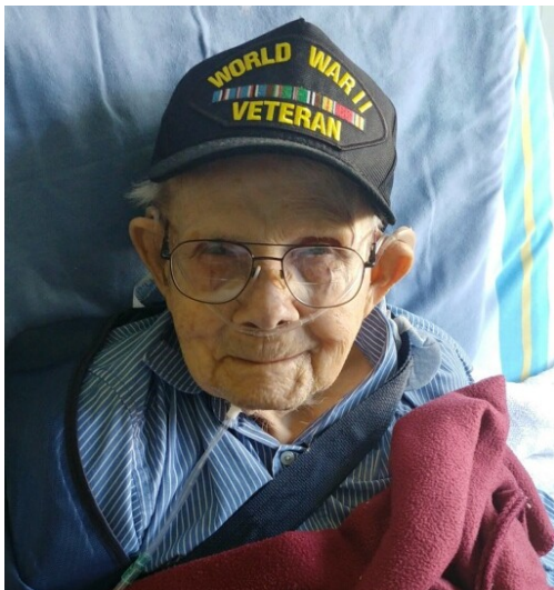
8-27-21 One of the last pictures made by one of his many caregivers and sent to me for my birthday. He still had those big ears, we all teased him about.